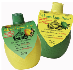
Where the great flavor comes from!

Dream Foods also saw the chance to fill a tremendous need in the market to sell organic lemon and lime juices in squeeze bottles and do so under the brand name, Volcano Lemon Burst® and Volcano Lime Burst®. Although the juicing process is the same, it is the patented cap with the lemon or lime zest that gives the juice the essential oils in every squeeze for the great fresh-squeezed smell and taste. Sales data has proven Volcano Lemon and Lime Bursts® increase category growth by 30%. Volcano Bursts® have out sold competitors' brands that use harsh chemicals as preservatives.